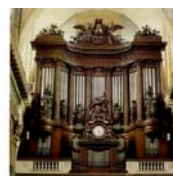
The Organ of St. Sulpice Les Chantiers Organs de Saint-Sulpice

Here you will find the history of the instrument, specifications, discography, the schedule of music for concerts, auditions and masses, and an audio/video section featuring video taken by yours truly!